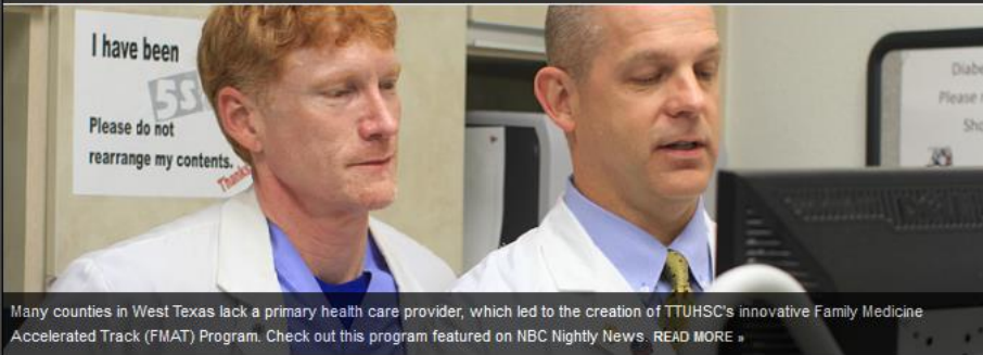
Many counties in West Texas lack a primary health care provider, which led to the creation of TTUHSC's innovative Family Medicine Accelerated Track (FMAT) Program. Check out this program featured on NBC Nightly News. READ MORE »